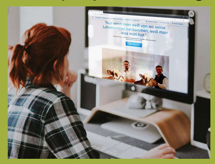
Digital education and online marketing for local producers and farm shops